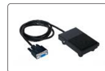
foot switch (optional)