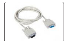
RS232 cable (optional)