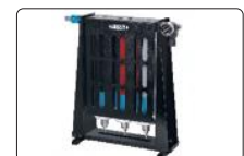
air filter (optional)