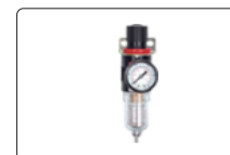
pressure regulating valve (optional)